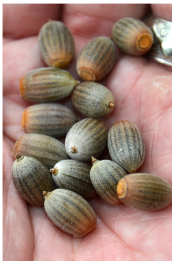
Acorns collected in 2016.